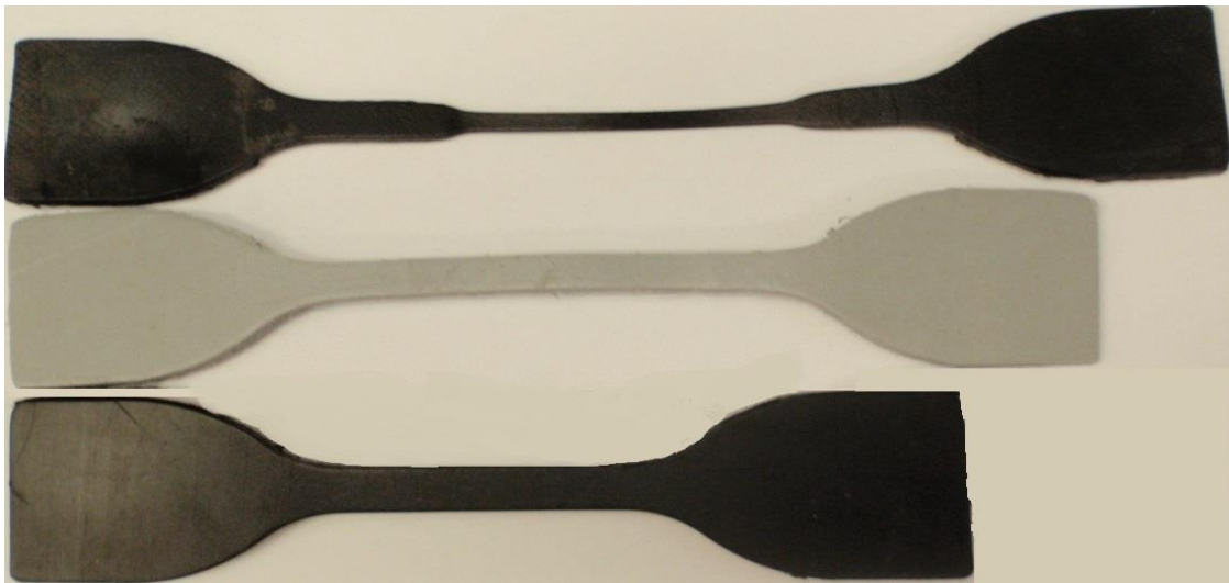
Figure 1: Recovery from 200% Stretching, from top down; HDPE, Precidium™ ECS, control