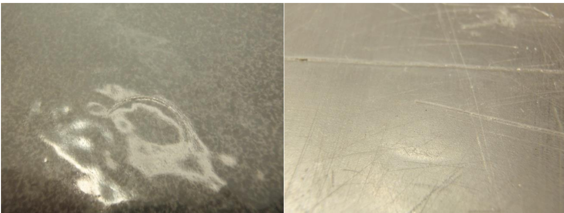
Figure 3: Precidium™ ECS after 320 inch-lb impact